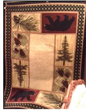
Adirondack Area Rug, 5'x8'