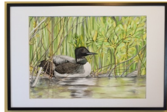
Loon at Water's Edge