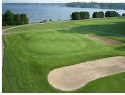
Bluff Point, Greens Fees for 4