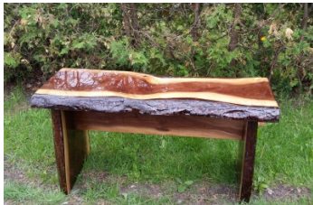
Black Walnut Hall Bench