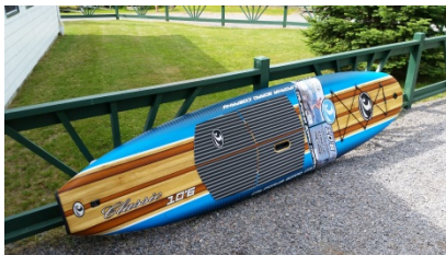
Paddleboard & Paddle