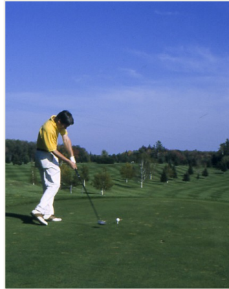
Saranac Inn, Greens Fees for 4