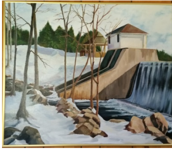
Chateaugay Lake Dam